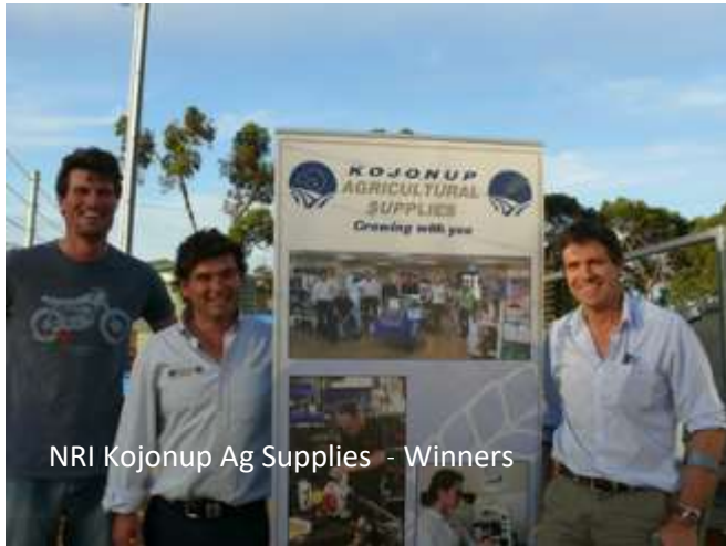
NRI Kojonup Ag Supplies - Winners

Connecting your business with farmers in the field